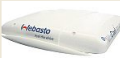
Delta Auto Spark is a proud supplier of Webasto products.

Fuel efficiency, more power and economy the end result