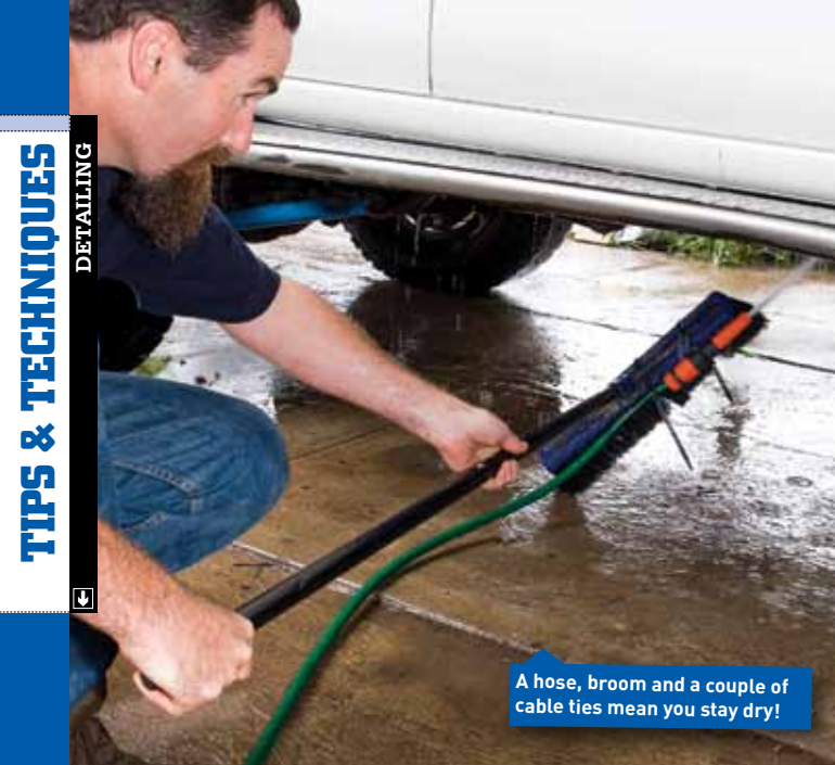
A hose, broom and a couple of cable ties mean you stay dry!