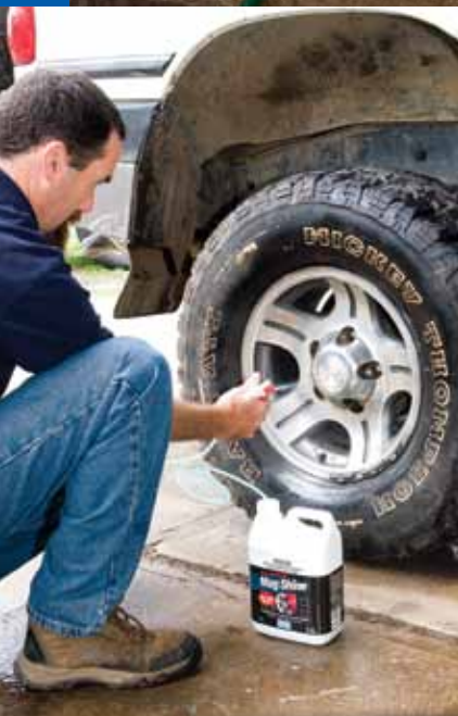
CT18 is one of the only cleaners that will remove red dust from outback Australia