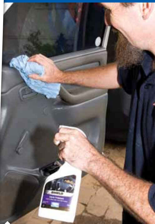
The use of a vinyl protectant will save the panels from damage