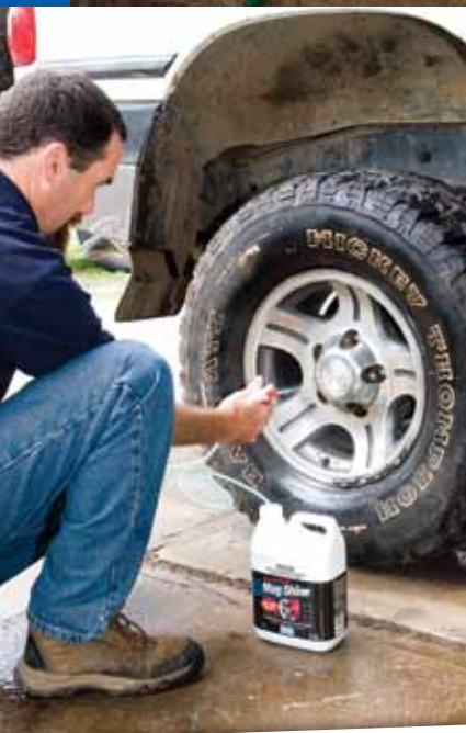
CT18 is one of the only cleaners that will remove red dust from outback Australia