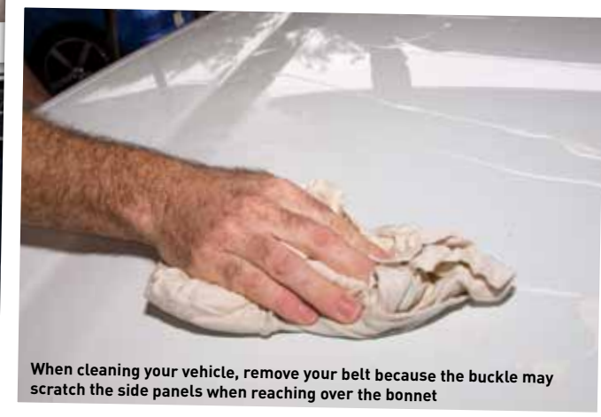
When cleaning your vehicle, remove your belt because the buckle may scratch the side panels when reaching over the bonnet