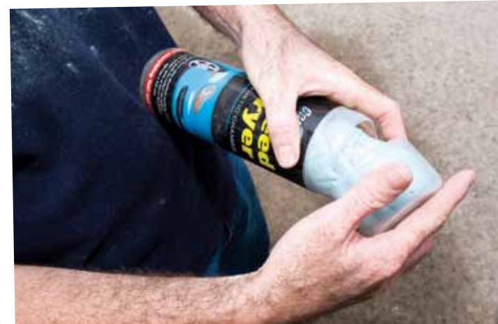
A chamois should always be stored in a sealed container to prevent it from drying out

Have you ever found after a big trip that your truck has dust in areas that you can see but can't get to? Without completely pulling apart the vehicle, we will show you some handy hints that will make it seem too easy.