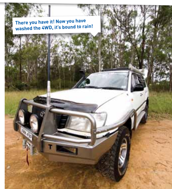
There you have it! Now you have washed the 4WD, it's bound to rain!

While you have the CT18 in the sprayer, coat the undercarriage with the cleaner. Once applied, let it soak for a couple of hours. This will clean off mud, road grime and oil residue from the vehicle.