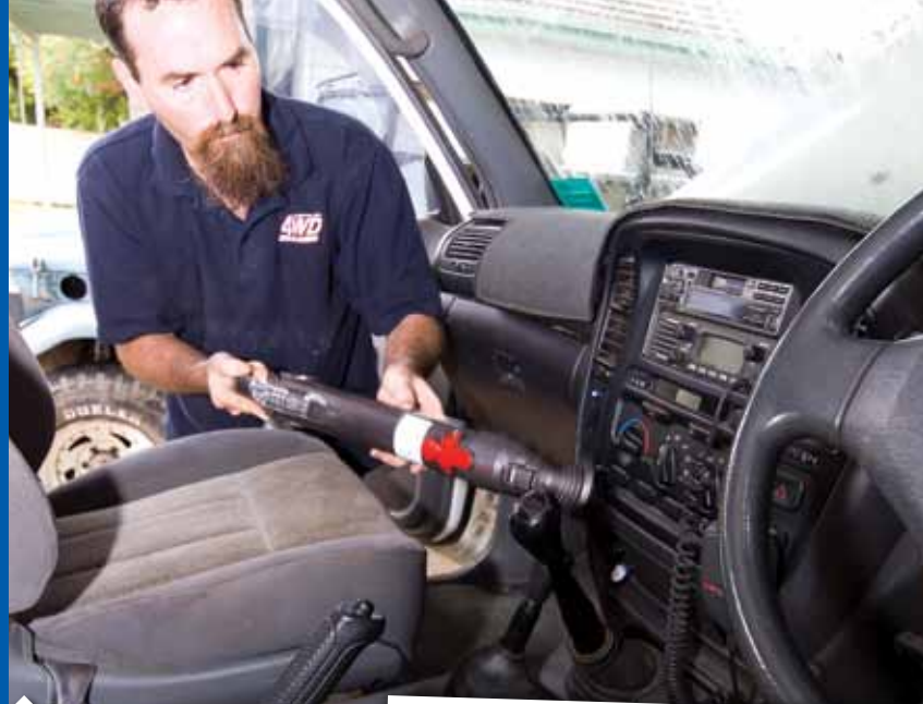
Vacuum all seats, floors, even the dash!