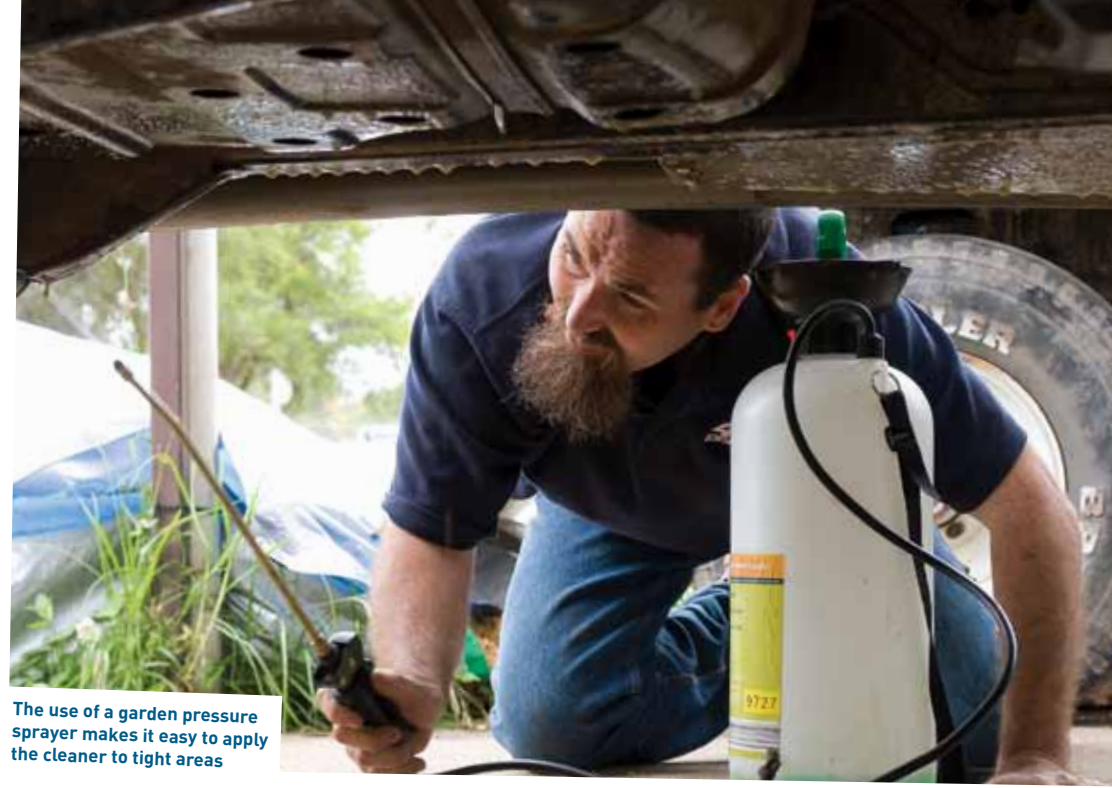
The use of a garden pressure sprayer makes it easy to apply the cleaner to tight areas

The use of mag cleaner is the easiest way to clean off the road grime and brake dust from the wheels. Just apply the cleaner, leave it for three minutes, then hose it off for a good clean. You