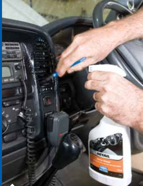
All it takes is a $2 paintbrush and some cleaner to remove the dust from the vents