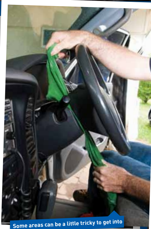
Some areas can be a little tricky to get into

Once the vinyl has been cleaned and dried, wipe it over with a good-quality protectant. This will reduce the effects that heat, sunlight and