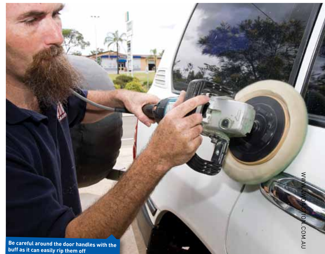
Be careful around the door handles with the buff as it can easily rip them off

Using a chamois, wipe the body and all the inner door edges. Keep ringing out the chamois as you go. Once finished, run the chamois under a tap to rinse it out (don't use